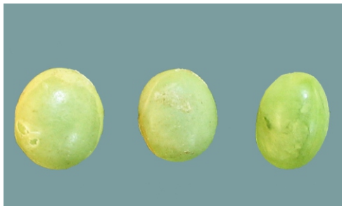
Gebrekkige sojabone - Groen verkleuring Defective soya beans - Green discolouration