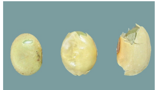
Gebrekkige sojabone - Witterige membraan (rypskade) Defective soya beans - Whitish membrane (frost damaged)