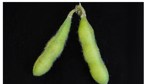
Groenpeule Green pods