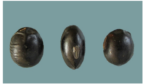
Sojabone - Geneties swart Soya beans - Genetic black