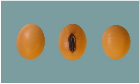
Sojabone - Gesond Soya beans - Sound