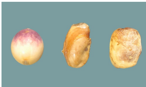
Gebrekkige sojabone - Plantsiekte aangetas Defective soya beans - Plant disease contaminated