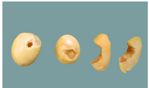
Gebrekkige sojabone - Insekbeskadig Defective soya beans - Insect damaged